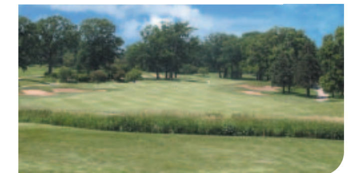
Hole #10 The breathtaking view of blossoming flowers and majestic oak trees creates a beautiful backdrop for an uphill par five. Tee ball should be placed on the right side of the fairway providing the best approach to this three tiered green.

One of the best parts of living next to Seven Bridges golf course are the views of park-like nature. From the rolling green hills in summer, the fiery colors of autumn, the shimmering white snow-covered trees in winter and the soft, bright colors of the flowers in spring. There's also an outdoor pool on the third floor that overlooks the course. Stroll through the exciting new Main Street at Seven Bridges and do some shopping before having dinner out. Or just stay home and enjoy the incredible views of the course.