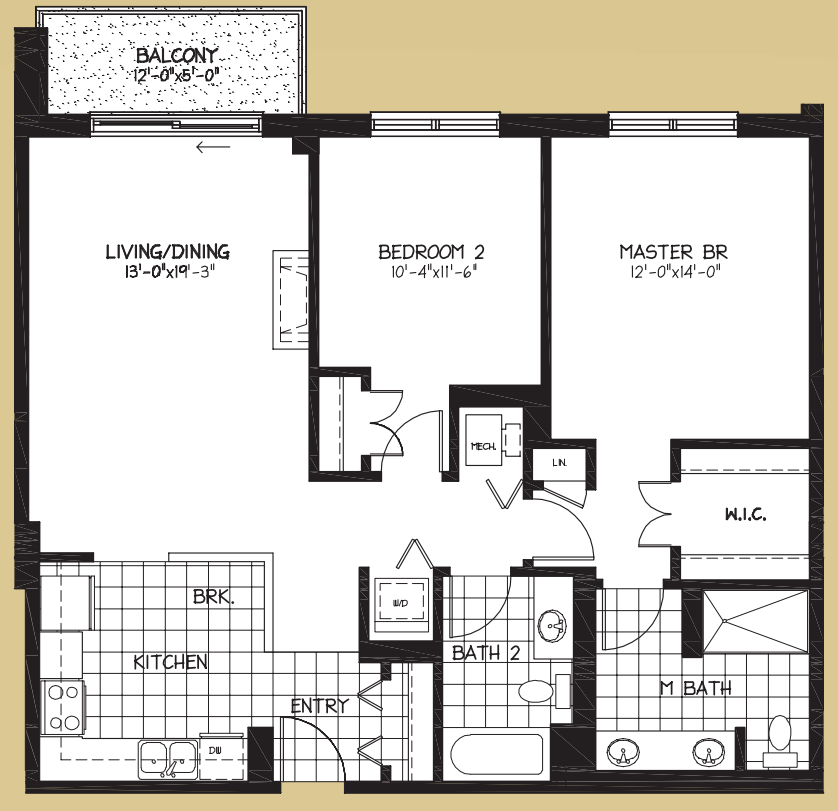
2 Bedrooms • 1,204 S.F.