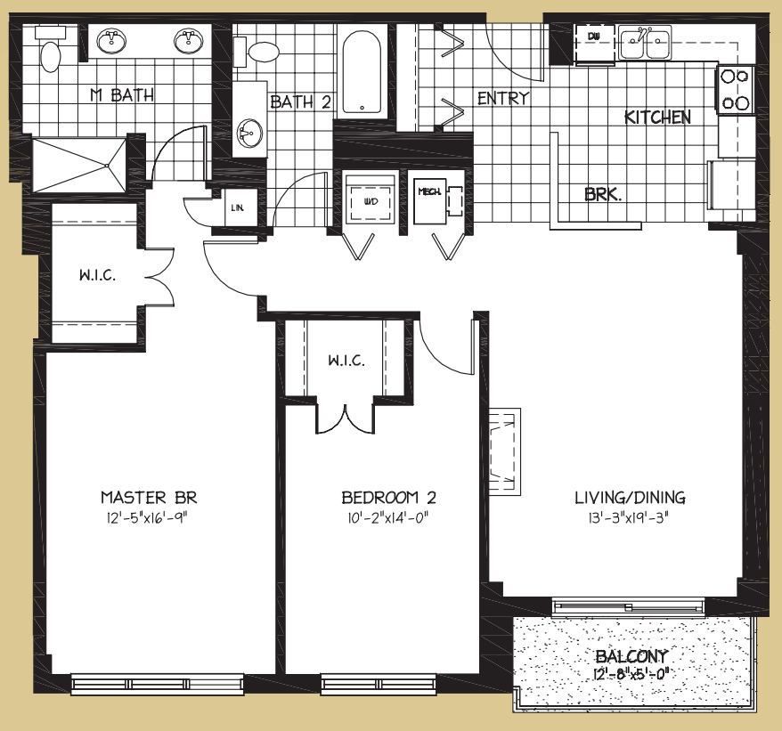
2 Bedrooms • 1,332 S.F.